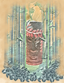
ARASHIYAMA BAMBOO GROVE