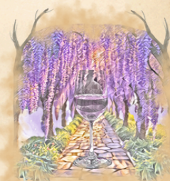
ASHIKAGA FLOWER PARK